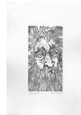
Barbara Patera Seattle Area, Washington USA Print Title: "Charon"

Paper Dimension: 7x5" Image Dimension: 5.25 x 4" Block: Shina plywood Pigment or Ink: Paper: Mulberry Edition: 32