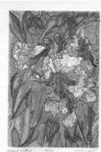
Maria Arango Las Vegas, Nevada USA Print Title: "Mojave Willow" Paper Dimension: 7" x 5" Image Dimension: 6" x 4" Block: 6 Shina ply Ink: Akua-Kolor pigments Paper: New Hosho Edition: 100

Comments: Japanese traditional moku-hanga.. About a month ago, our desert garden decided to reward us with some color. This "desert garden" used to be referred to as "the back-40". When we first moved in we gracefully called it "raw desert" and it was near five years before we got around to planting some desert hardy plants, shrubs and trees. Fast forward another five years of planting, moving, about a mile of drip irrigation trenching, pipe, hoses and drip heads...and VOILA! A beautiful desert garden with flowering trees, sage, and other assorted Mojave native and Mojave hardy plants. The willows, my first tribute to the garden, bloom all summer and recently in early fall. Bees are attracted to the pollen in the yellow center, guided there by the twin "runways" of the flower. Here is a gift from the hardy Mojave Willow.