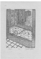
Scott W. Robertson Ohio USA Print Title: "Hope"

Paper Dimension: 170x123mm Image Dimension: 170x123mm Block: Pigment or Ink: Charbonnel and Sun Chemical - oil based Paper: Hanemühler Edition: 31 Comments: 2 blocks of curupixa plywood, a metal plate (engraving and etching) and some watercolor.