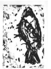
Ellen Holtzblatt Chicago, Illinois USA Print Title: "Dead Bird"

Paper Dimension: 5" x 7" Image Dimension: Roughly 4 1/2" x 6 1/2" Block: The key block is lino, the two color blocks are Luan plywood. Pigment or Ink: Akua Kolor Paper: Rives BFK Edition: 45 Comments: This was fun. I used a lino key block to reduce the variation in my line work, since the only wood I have on hand is Luan. The Luan, however, was perfect for the color blocks, which were meant to be irregular and grainy. To achieve the translucent blues and greens, quite a bit of transparent base was added to the Akua Kolors. The edition was printed with a disk baren.