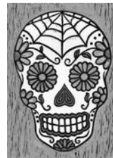
Viza Arlington Cheney, Washington USA Print Title: "Sugar Skull" Paper Dimension: 5" X 7" Image Dimension: 5" X 7" Block: linoleum Pigment or Ink: black oil based Paper: Rives BFK Edition: open/monoprint Comments: each print is hand colored and all are different