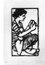
Tina Browder Chicago, Illinois USA Print Title: "Dry"

Paper Dimension: 5" x 7" Image Dimension: 4 1/16" x 6 1/8" Block: All Shina Pigment or Ink: Caligo Safewash Inks Paper: Rive BFK Cream, 280 gsm Edition: 31