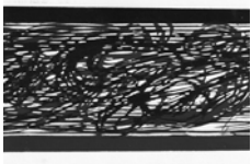
Scott Betz Winston-Salem, North Carolina Print Title: "Shell"

Paper Dimension: 5"x7" Image Dimension: 4"x7" Block: Wood Pigment or Ink: Dan Smith Paper: Bristol Vellum Edition: 31