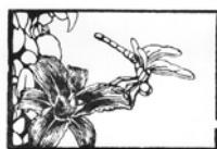
Austin Still Missouri USA