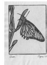
Alex Orgren Andover, New Jersey USA Print Title: "Queen"

Paper Dimension: 12.5 x 17.5 cm Image Dimension: 10 x 15 cm Block: Matsumura Shina Plywood Pigment or Ink: Naigai new HST Black Paper: Echizen Torinoko Edition: 45 Comments: Sweetly dreaming.