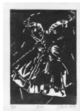
Juergen Stieler Flensburg, Germany

Comments: Toggle Bolt, the first Figure in the imaginary and now out-of-print classic handbook of European and American Fasteners. A guide for those who often choose the wrong tool for the wrong job. There are holes all over my walls. The keyblock was kiln dried cherry and held the detail pretty well although I had to use a scalpel with an #11 blade to carve out the small print. I printed the background block first to smooth out the paper for the keyblock with the type--which then printed more cleanly than if printed first.