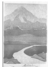
Barbara Mason Aloha, Oregon USA Print Title: "Mt. Hood Revisited"

Paper Dimension: 7" x 5" Image Dimension: 6" x 4" Block: shina Pigment or Ink: Charbonnel etching ink Paper: Torinoko Handmade White Edition: 39