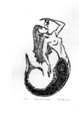
Kim Roddy Nine Mile Falls, Washington, USA Print Title: "Mermaid Kisses"

Paper Dimension: 5" x 7" Image Dimension: 3 1/2" by 4 5/8" Block: Baltic Birch Ply Pigment or Ink: Gpaphic Chemical Etching Inks Paper: nideggen Edition: 31 Comments: six blocks eight colors hand printed.