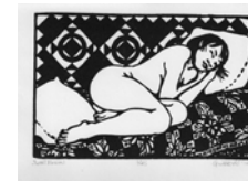
George Jarvis Akita, Japan Print Title: "Sweet Dreams"

Paper Dimension: 6"x8" Image Dimension: 4"x6" Block: Speedball Grey Linoleum Pigment or Ink: Speedball Water Based Black and Gold Paper: Sumi-E Sketch Paper Edition: Open Comments: Dragonflies dart and dash and flit about at water's edge, jewel-like among the green leaves and grasses, voracious predators in glistening armor.