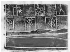
Jerelee Basist Orkney Isles, Scotland Print Title: "Wishing Stone" Paper Dimension: 5" X 7" Image Dimension: 4" X 6" Block: white line woodblock Pigment or Ink: watercolor Paper: Japanese something Edition: 34

Comments: Japanese traditional moku-hanga.. About a month ago, our desert garden decided to reward us with some color. This "desert garden" used to be referred to as "the back-40". When we first moved in we gracefully called it "raw desert" and it was near five years before we got around to planting some desert hardy plants, shrubs and trees. Fast forward another five years of planting, moving, about a mile of drip irrigation trenching, pipe, hoses and drip heads...and VOILA! A beautiful desert garden with flowering trees, sage, and other assorted Mojave native and Mojave hardy plants. The willows, my first tribute to the garden, bloom all summer and recently in early fall. Bees are attracted to the pollen in the yellow center, guided there by the twin "runways" of the flower. Here is a gift from the hardy Mojave Willow.