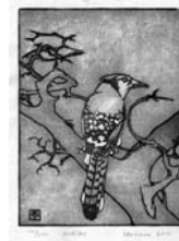
Brad Bateman Gatineau, Quebec, Canada Print Title: "Blue Jay" Paper Dimension: 5" x 7" Image Dimension: 6" x 4.5" Block: Wood Pigment or Ink: Paper: Washi Edition: 200 Comments: This image started out as a study of tree branch form. I'd intended to have a little bird in there somewhere but the blue jay bullied his/her way into the front center. Toshi Yoshida's "Plum Tree with Blue Magpies" was close by during the design and printing process as was Clare Walker Leslie's book Nature Drawing.