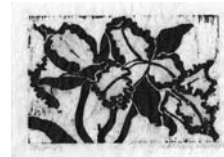
Claudia Coonen Haiku, Maui, Hawaii USA Print Title: "Sunset Orchid"

Paper Dimension: 5"x7" Image Dimension: 4"x6" Block: white wood Pigment or Ink: Blick WS Black Paper: Kozo Edition: 31